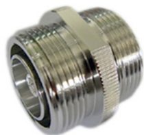
7-16 DIN Female to 7-16 DIN Female Adapter