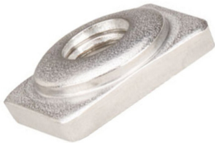
Universal Angle Adapter Insert